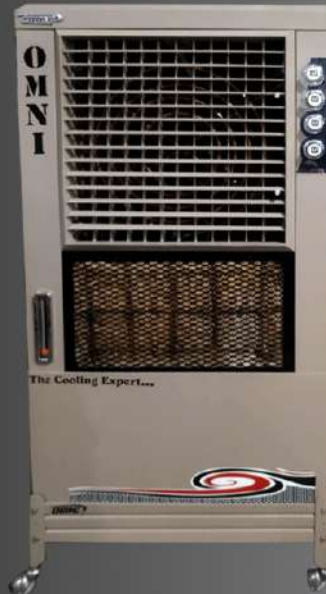
ALL IN ONE